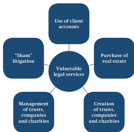
Figure 2: Money laundering and terrorist financing – susceptible legal services 37

FATF has identified certain legal services, though not necessarily accepted by the legal profession, as particularly susceptible to misuse by criminals in the context of money laundering and terrorist financing: